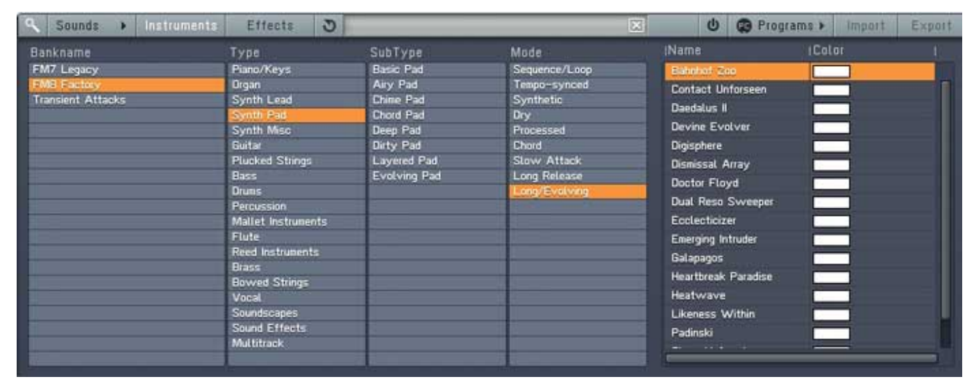
Generate Public Key Certificate Linux

Results 1 - 20 of 11000 - 57 results - Spectrasonics Omnisphere Keygen Team Air Torrents > Torrent Downloads » Software » Spectrasonics.. [Installing] 1 I manually mounted the ISO files Omnisphere 2 Keygen TorrentI copied and merged the STEAM folders into /Library/Application Support/Spectrasonics 2. <u>La Vida De Las Aguilas A Los 40 Anos</u>